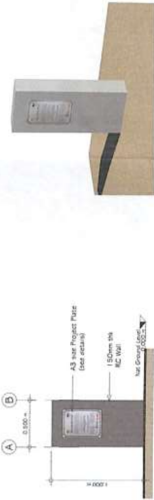
3 3D VIEW A101 NTS